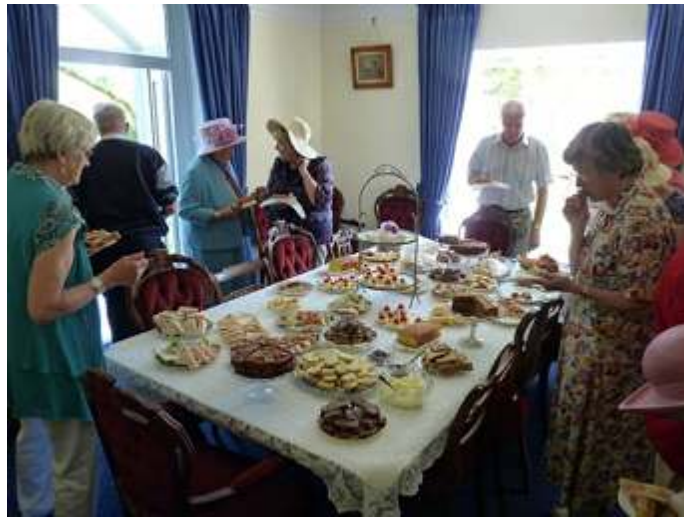
Two Pictures of our June Garden Party